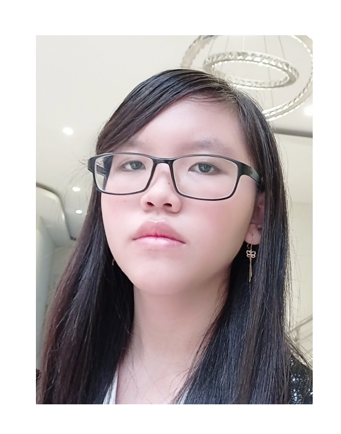
Tara Lumina Indonesia